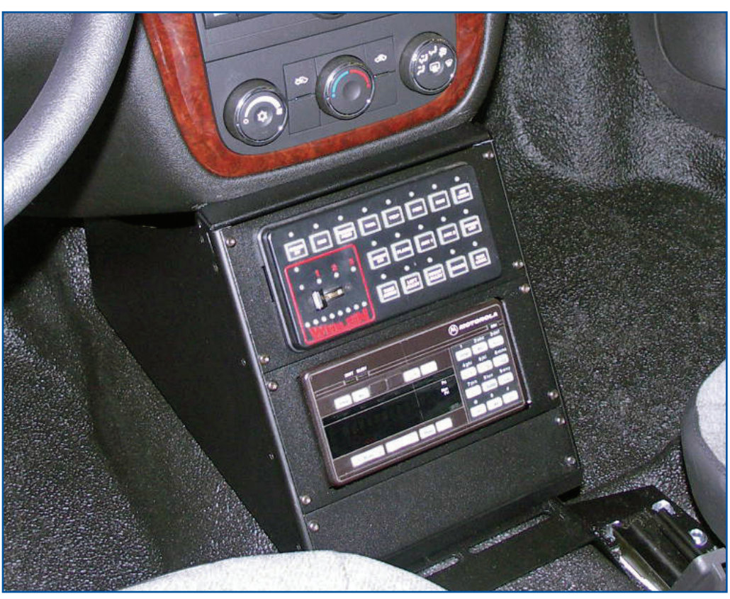
2006 Chevrolet Impala Vehicle Specific Console

This new vehicle-specific OEM replacement console provides professional and custom appearance. The console is manufactured from laser cut steel to precisely fit OEM dash trim. The formed steel housing and extruded aluminum frame provide strength for mounting up to 10" of emergency equipment.